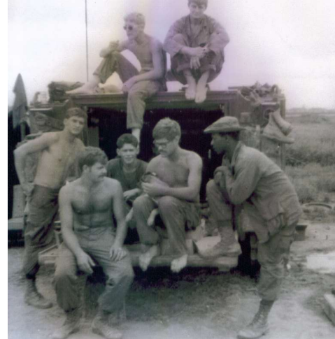
MEMBER 3.JPG (781x794)