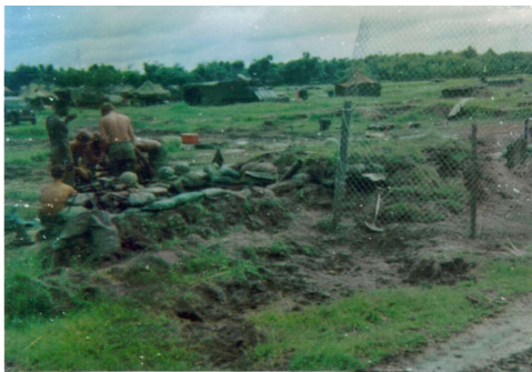
Our squad checking out operation order Fire Base.jpg (1009x693)