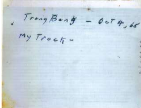
Trang Bang, Oct 4, 1968 My Track.JPG (317x426)