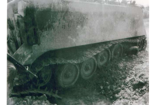
My track after it hit the mine October 4, 1968 Trang Bang.jpg (651x489)